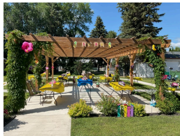
All set up and waiting for guests to arrive.