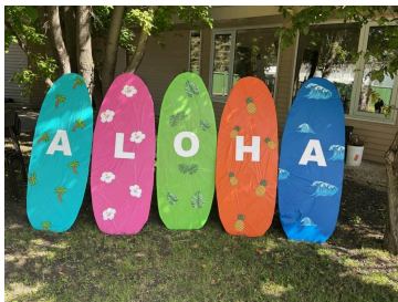
Surf board decorations