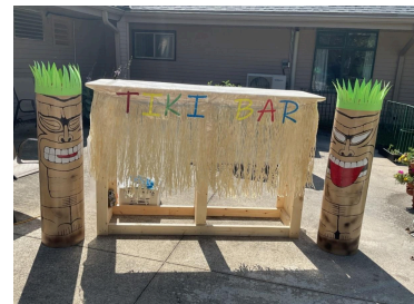
Tiki bar where non-alcoholic pina coladas and mai tais were served.